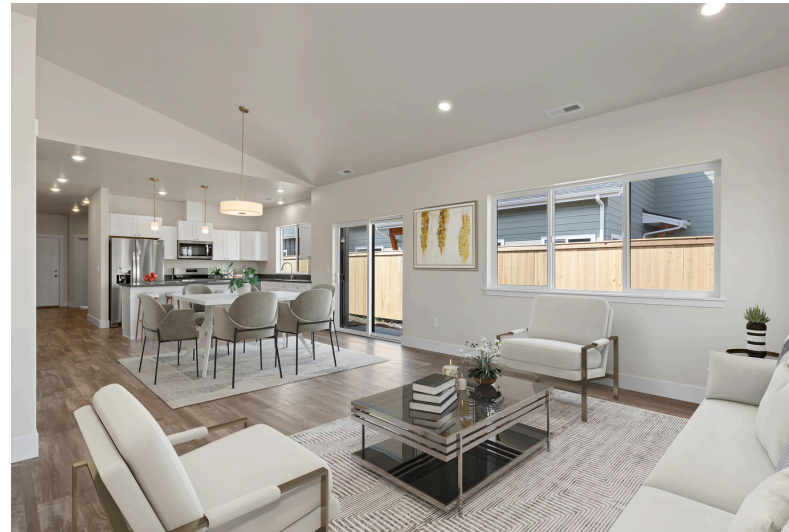
KITCHEN AND LIVING ROOM